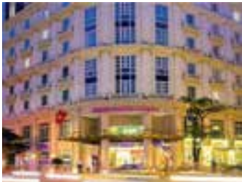
Mercure Hanoi La Gare