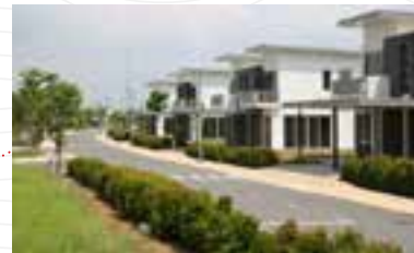
DAI PHUOC LOTUS