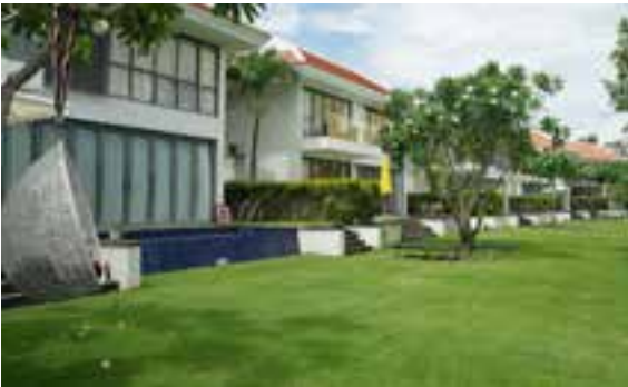
THE OCEAN VILLAS DA NANG