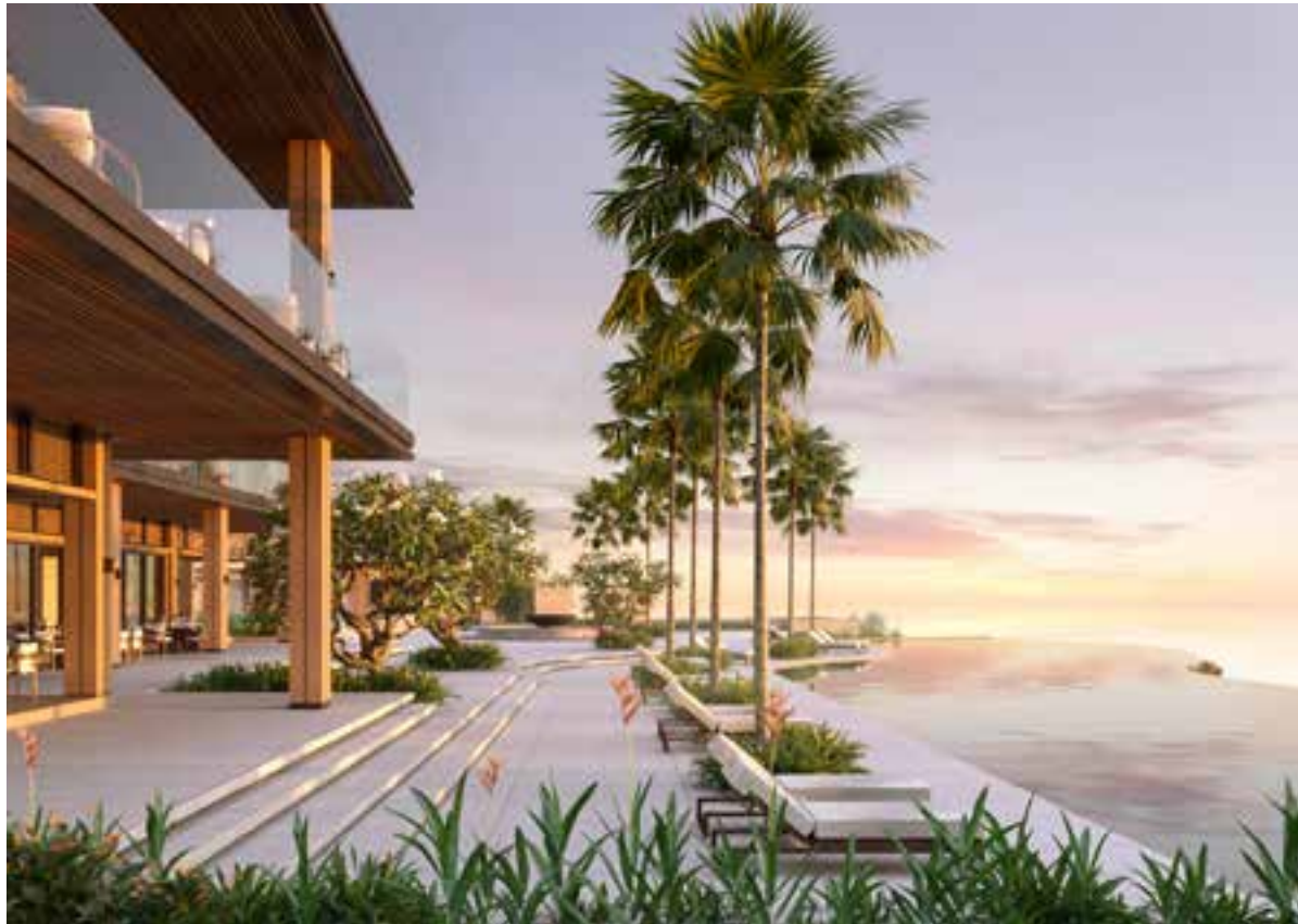
VINH HOI PROJECT