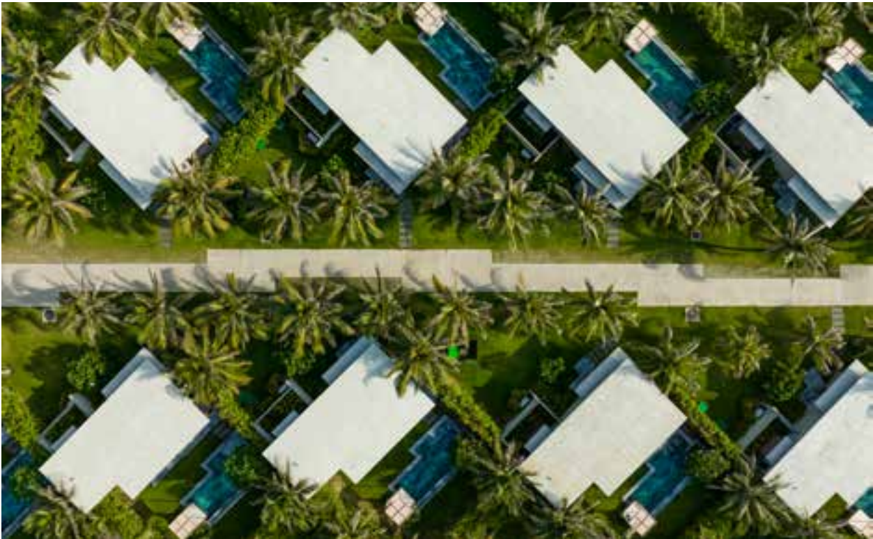
MAIA RESORT QUY NHON

We apply our quality commitment through a rigid procedure of materials sourcing and selection that meets high quality, sustains the environment, and is preferably sourced locally with a respect for the Vietnamese regions and culture where our projects are in.