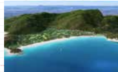
VINH HOI UP-COMING