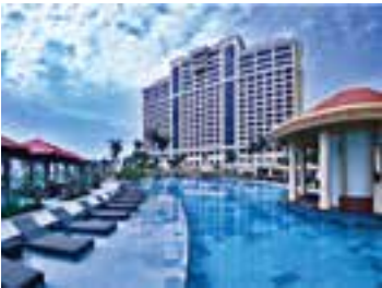
The Grand Ho Tram Strip