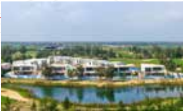
THE DUNE RESIDENCES