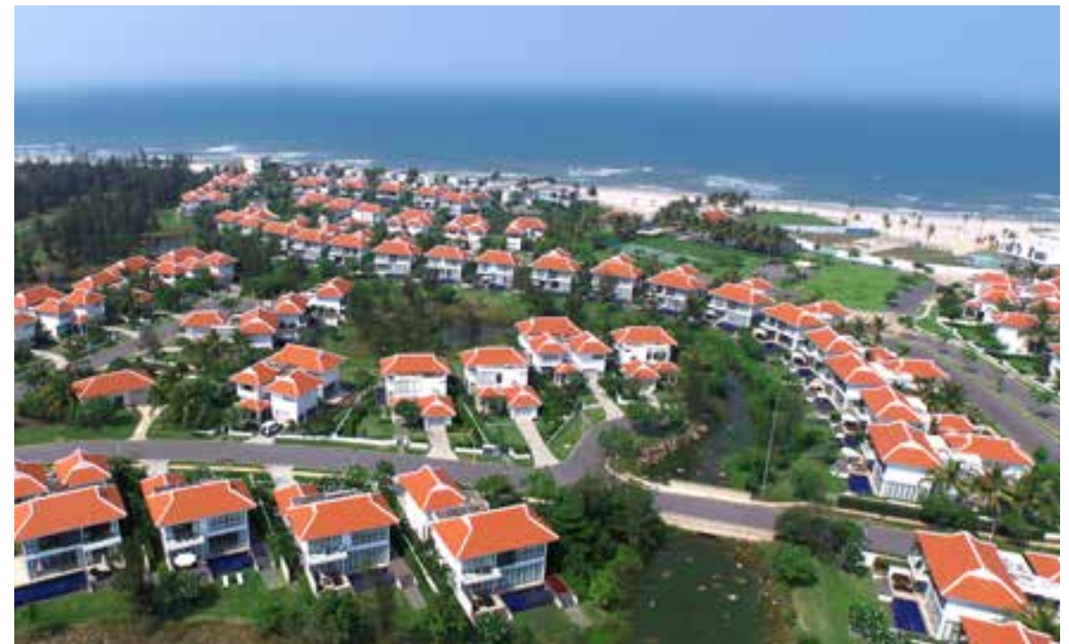
DANANG BEACH RESORT

International awards to VinaLiving for best Development Marketing in 2011, 2014 - 2015, 2015 - 2016