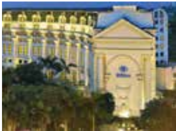
Hilton Hanoi Opera