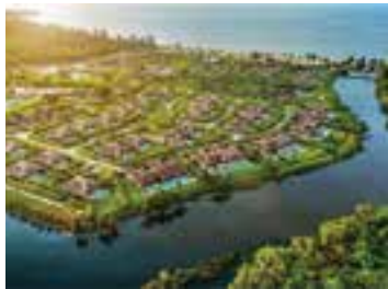
Fusion Resort Phu Quoc