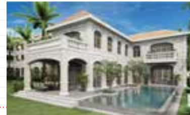
RIVER MANSION AQUA CITY