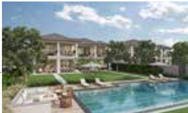
HOIANA SHORES GOLF VILLAS