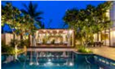
FUSION RESORT & VILLAS DA NANG