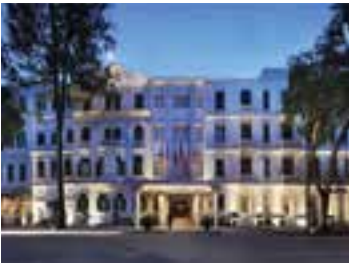
Sofitel Legend Metropole Hanoi