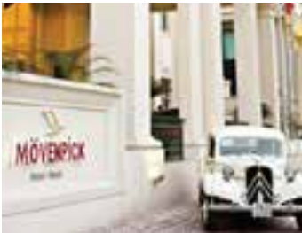
Mövenpick Hotel Hanoi