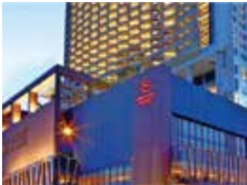
Sheraton Nha Trang Hotel & Spa