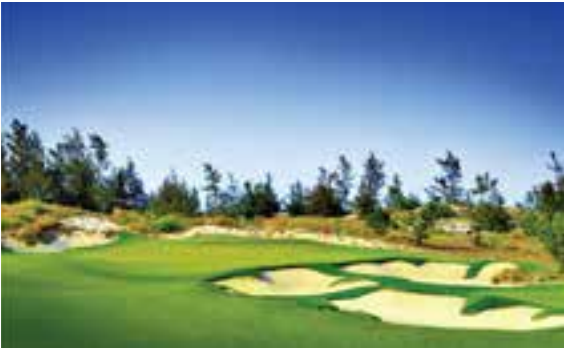
DA NANG GOLF COURSE

As a part of VinaCapital, one of the most reputable and well-respected hospitality investors in Vietnam, VinaLiving has partnered with leading hotel operators such as Accor, Hilton, Starwood, New World, Hyatt as well as home-grown brands like Fusion and Maia.