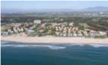
THE OCEAN VILLAS