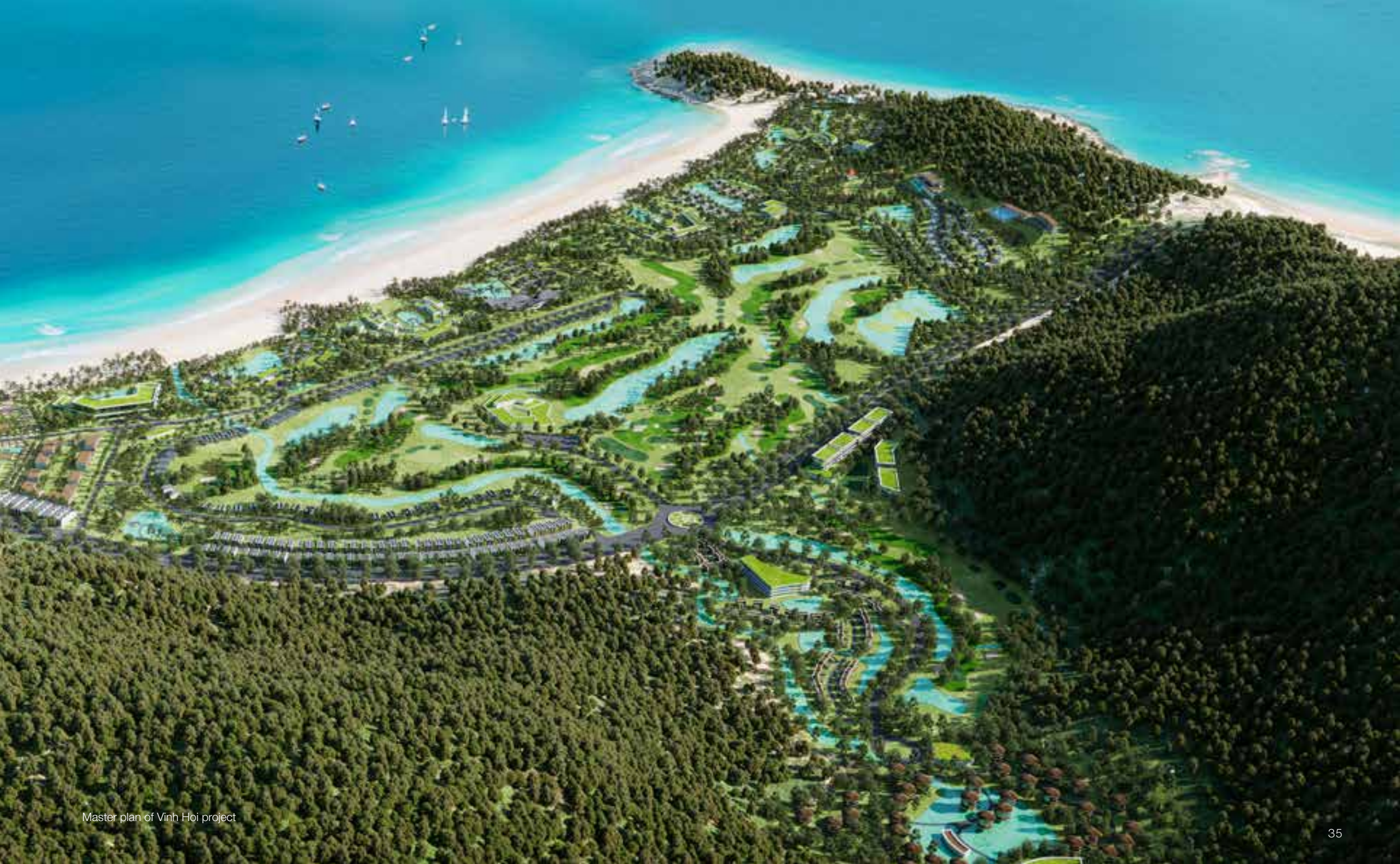
Master plan of Vinh Hoi project