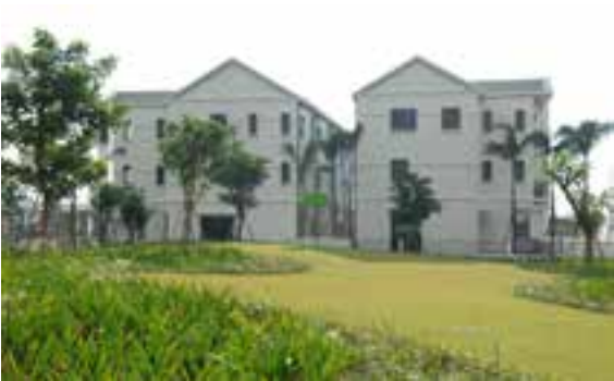
NINE SOUTH ESTATES

Innovation and quality are fundamental to our projects. Over the years, we have created trendsetting concepts with a high level of quality that will stand the test of time and generate lifelong value for our homeowners.