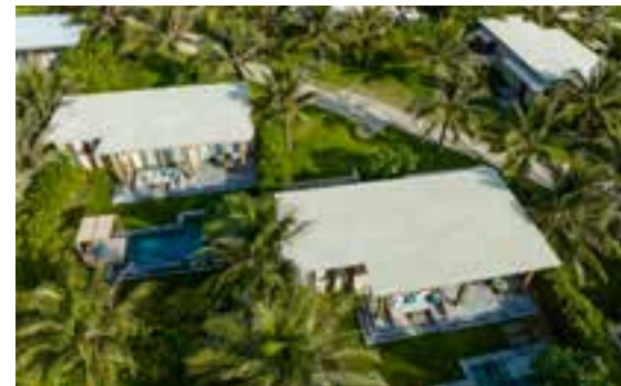
MAIA RESORT QUY NHON

By partnering with leading design studios, we apply our innovation to the latest trends while staying relevant to the Vietnamese lifestyle and preferences, and maintaining a strong respect for the culture, nature, and environment.