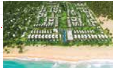
THE OCEAN VILLAS QUY NHON