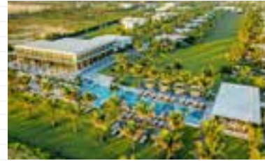
MAIA RESORT QUY NHON