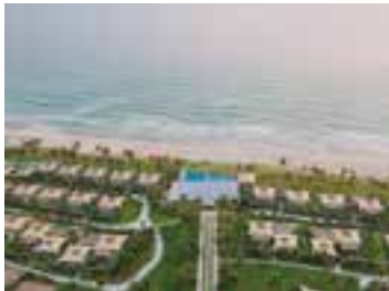
Fusion Resort Cam Ranh