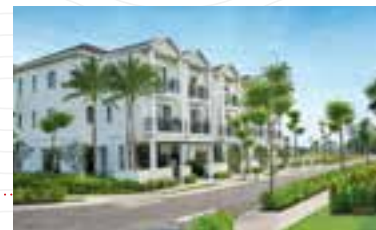
NINE SOUTH ESTATES