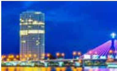
AZURA DA NANG