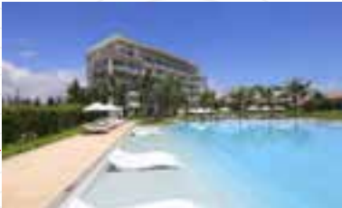
THE OCEAN SUITES