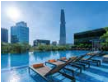
Fusion Original Saigon Centre*