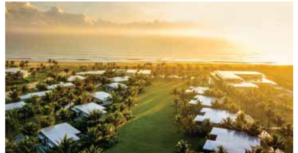
AERIAL VIEW OF MAIA RESORT QUY NHON

Our approach to ensuring high living standards and enhancing value is integrating the core components of hospitality with innovative concepts that deliver a unique lifestyle for homeowners.