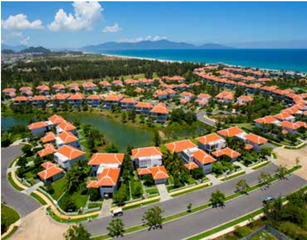
AERIAL VIEW OF DANANG BEACH RESORT

Holistic master planning is at the core of our project development. It is rooted in our in-depth understanding of the site and trendsetting lifestyle concepts, with the goal of sustainability.