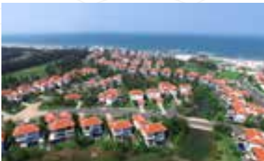
THE OCEAN ESTATES