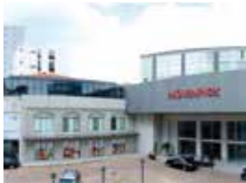
Mövenpick Ho Chi Minh