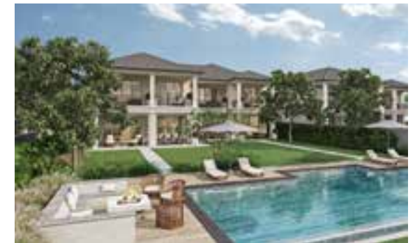
HOIANA SHORES GOLF VILLAS